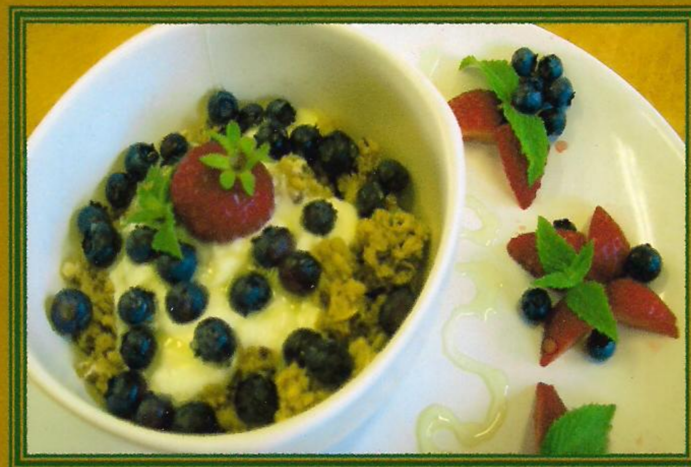
Organic Oatmeal with Fruit, Yogurt and Honey Regular ~ $ 3.75 Gluten Free ~ $ 4.25