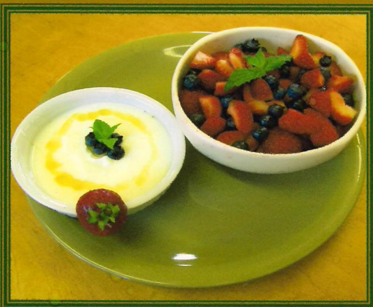
Fruit Bowl and Yogurt ~ $5