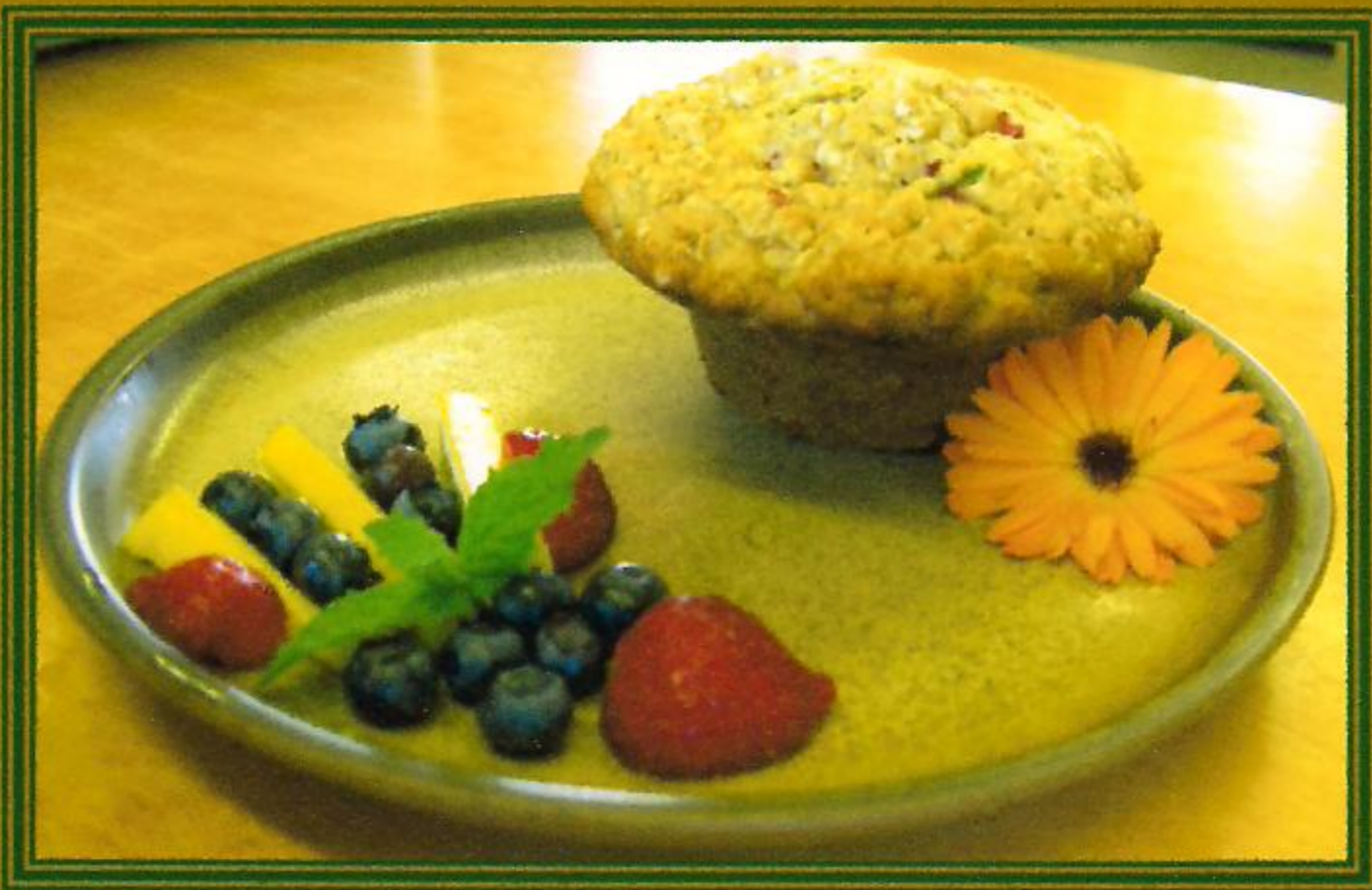
Homemade Berry Muffin with Oatmeal strudel topping and Fruit plate ~ $2.95